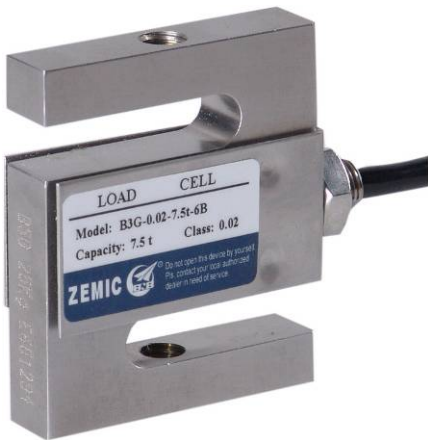
Models B3G, H3G, H3F and H3